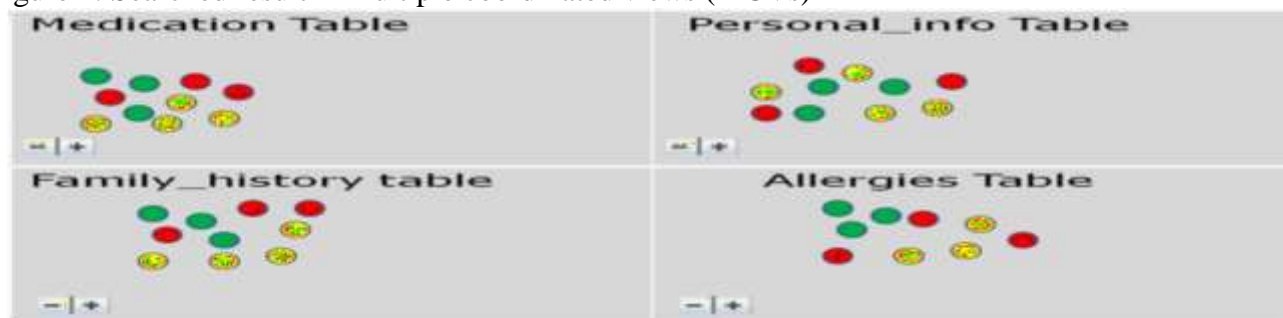
Figure 2: Searched result in multiple coordinated views (MCVs)

In the proposed visualization system, there will be an option where users will give the search keyword based on their need. After giving the search keyword, the retrieved result will be displayed on the screen (see Figure 2). For example, a user wants to see that what the treatment for a particular disease like —Migraine— was. Each table contains multiple attributes. Here Medication Table contains the disease name, treatment, condition, important findings, and symptoms. The personal information table, family history table, allergies table also contains multiple attributes. When a keyword is given for a particular attribute then the corresponding information will be displayed for the corresponding table in multiple coordinated views (MCVs) (see Figure 2). Then the user will be able to analyze data simultaneously in all views. Here each point on the medication table represents the search result for —Migraine—. Where red points indicate severe condition, yellow points indicate medium condition and green points indicate normal condition of the diseases. Therefore, when any keyword is given to the system then based on that keyword corresponding result will be displayed as points and other tables will display results based on the first attribute of each table.