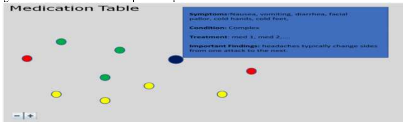
Figure 4: Details information of a particular point

Details-on-demand are set for all visualization techniques. The user selects the attributes that will be presented as additional information about each data item using the tabular box (see Figure 4). In this case user needs another level of interaction. For viewing the detailed result of any point, users have to click on that particular point, and then details information will be displayed in a tabular box.