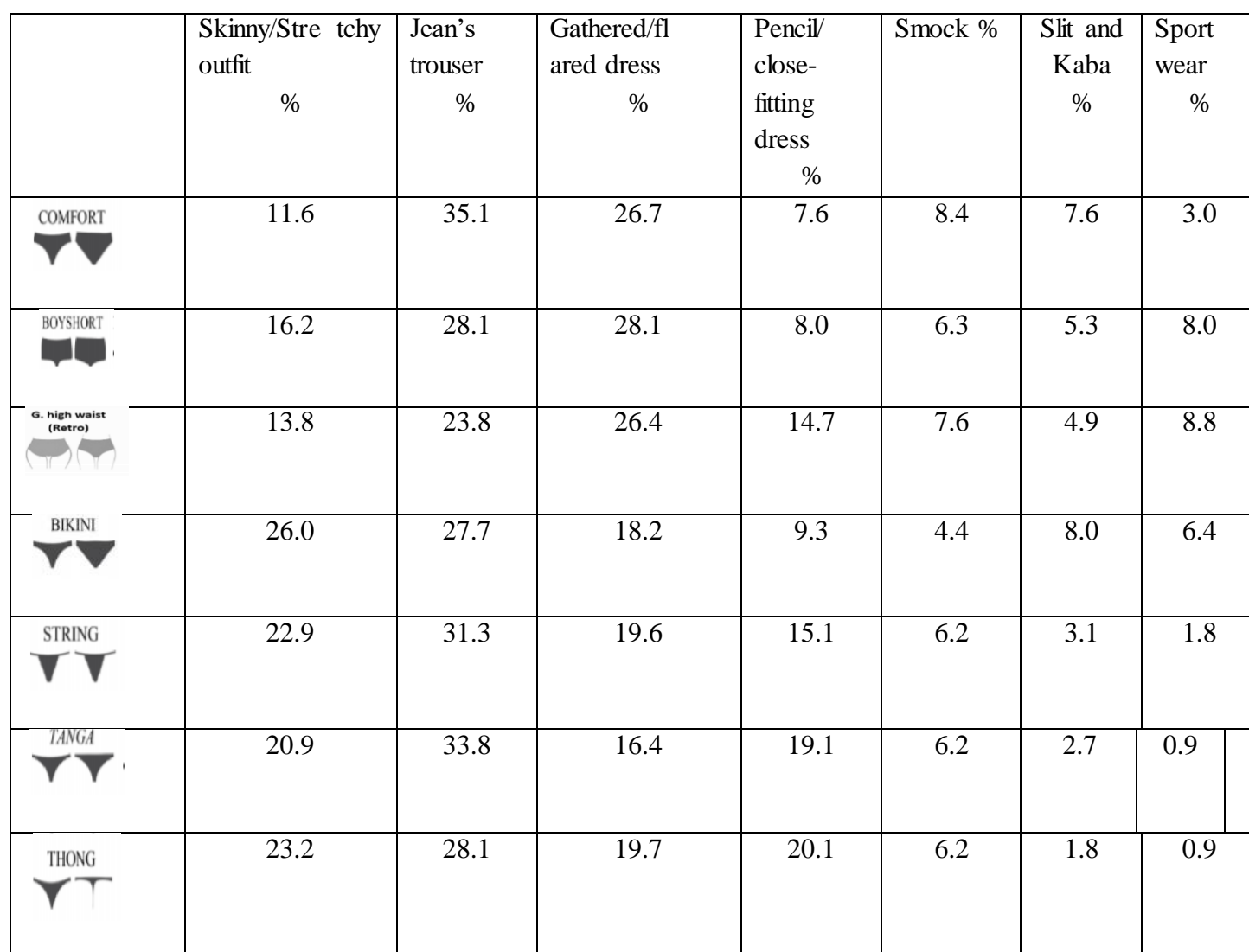
Table 6 showed that with stretchy garments the panty style used most is bikini. Comfort panty style is mostly worn under jeans trousers. Boyshorts was noted to be worn more under gathered and flared dresses (full garment). Thong was frequently used under pencil or fitted dress. Again, comfort panty style appears to be worn more under smocks. Slit and Kaba were used with bikinis regularly. In regards to the use of sport wears, highwaist was the most used.