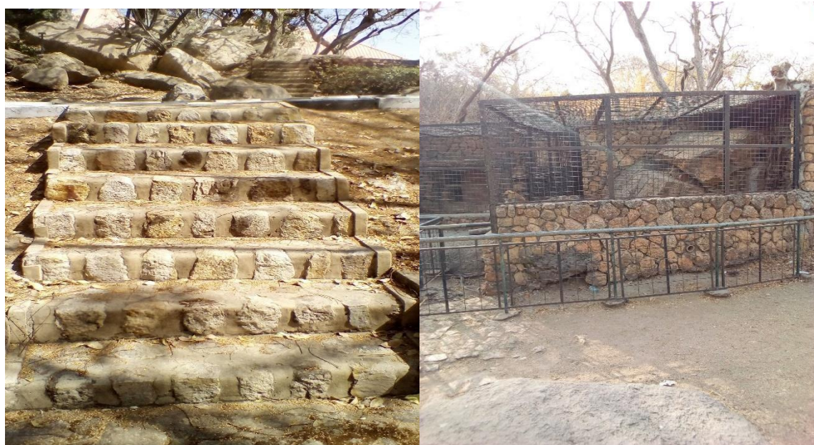
Plate xviii: Natural cut stones uses as steps at Hill Station Hotel, Jos