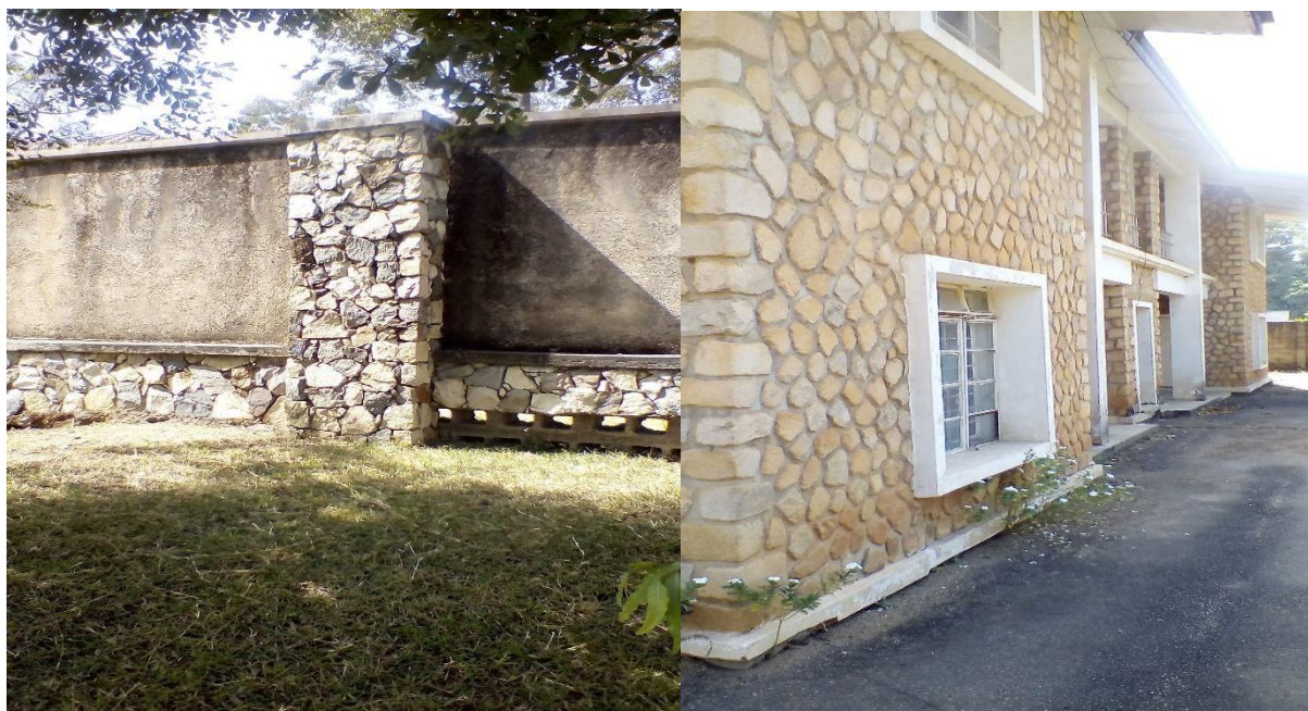
Plate xv: A mortared stone wall made from Limestone used for fencing at G.R.A. Jos.