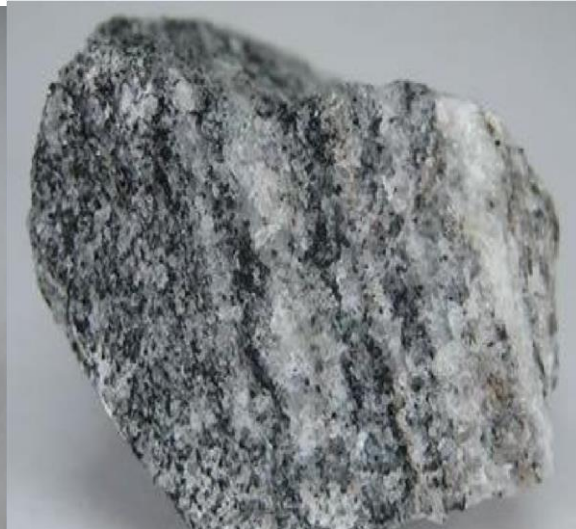
Plate xi: Gneiss is a foliated metamorphic rock that has a banded appearance and is made up of granular It is mineral grains. It typically contains abundant Quartz or feldspar minerals.