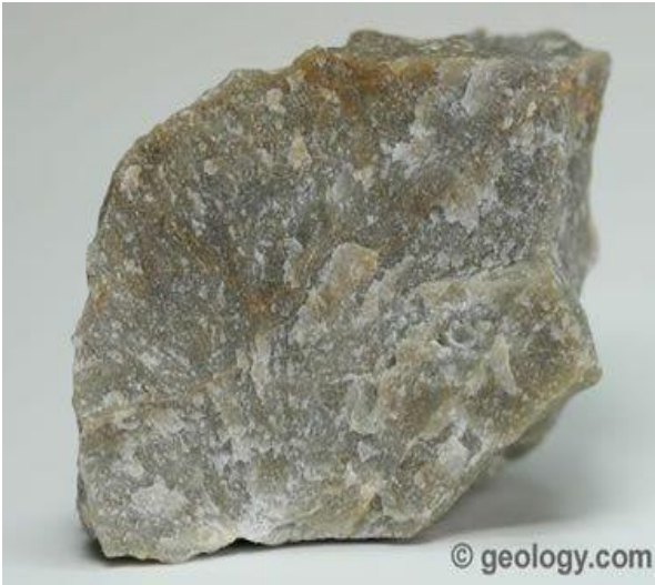
Plate viii: Quartzite is a non-foliated metamorphic rock produced by metamorphism of sandstone