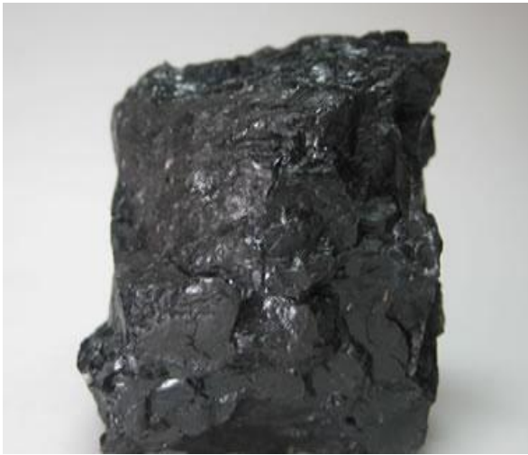
Plate v: Coal an organic sedimentary rock Formed from plant debris