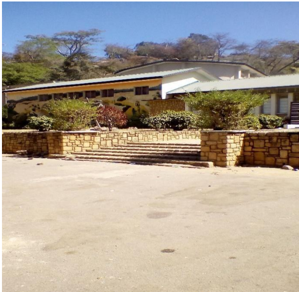
Plate xii: Irregular cut flagstone slabs steps leading to the art gallery at Jos, Zoo