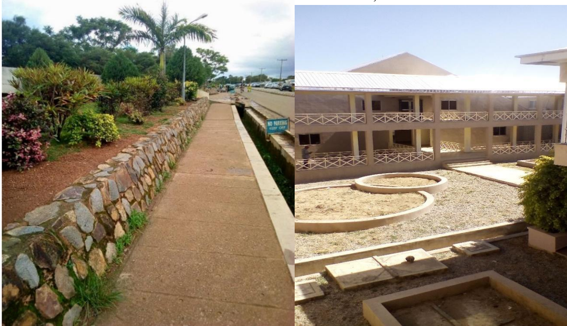
Plate xx: Sidewalk ways as hardscape element at Jos University Teaching Hospital,(JUTH) Plate xxi: Gravel used as mulch and natural ground cover at School of Post-Graduate studies, UNIJOS.