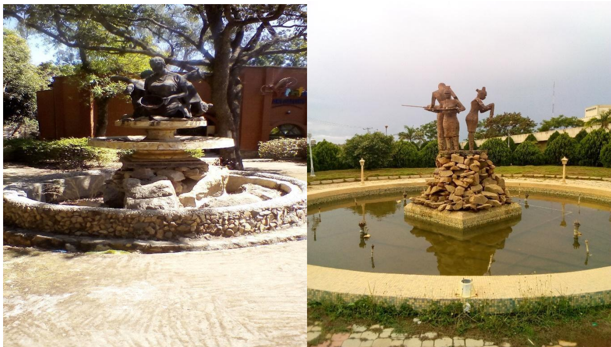
Plate xvii: Cobbles used as the base of water fountain which serves as focal points at the art gallery of Jos Zoo and the Jos University Teaching Hospital (JUTH) permanent site.