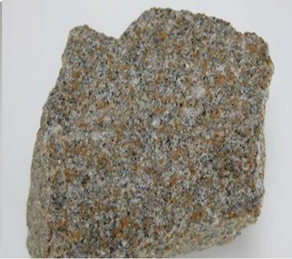
Plate vi: Sandstone a classic sedimentary rock made up of sand-size weathering debris.