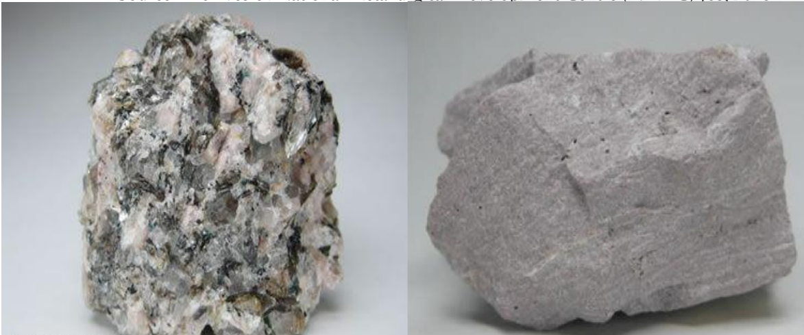
Plate iii: Pegmatite is a light-colored, extremely Coarse-grained intrusive igneous rock. Plate iv: Rhyolite is a light-colored, fine-grained Extrusive igneous rock.