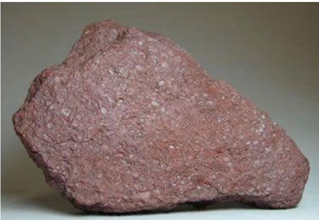
Plate vii: Iron Ore is a chemical sedimentary rock that forms when iron and oxygen (and sometimes other substances) combine in solution and deposit as a sediment.