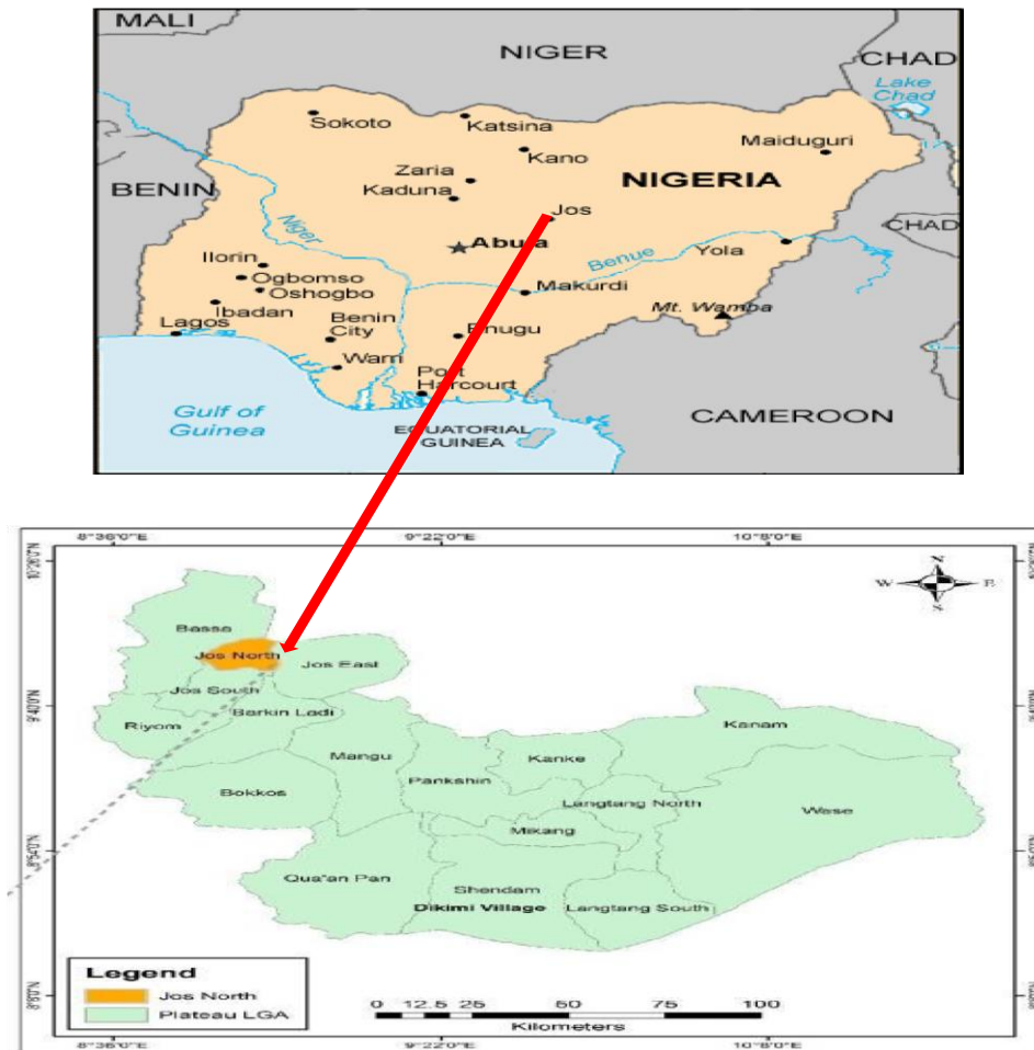
Figure 2: Map of Nigeria (top) showing Jos and Map of Plateau State (down) showing Study area.