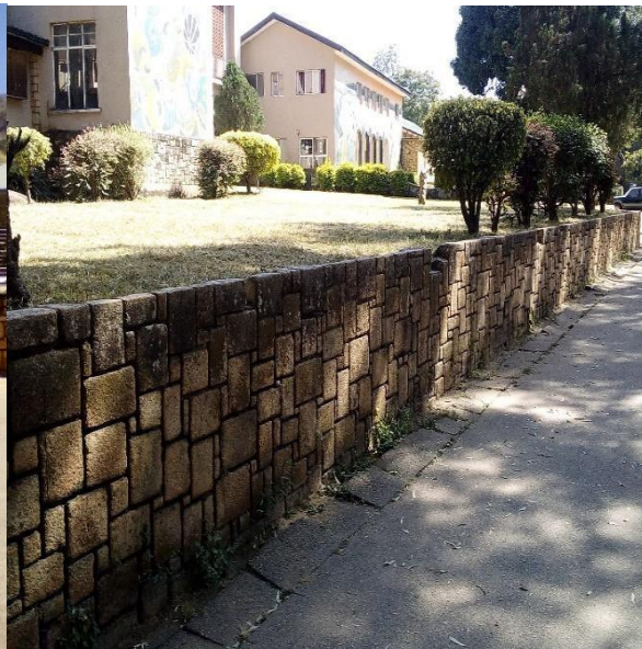
Plate xiii: Retaining walls constructed from cut stones/building at the Jos Zoological Garden