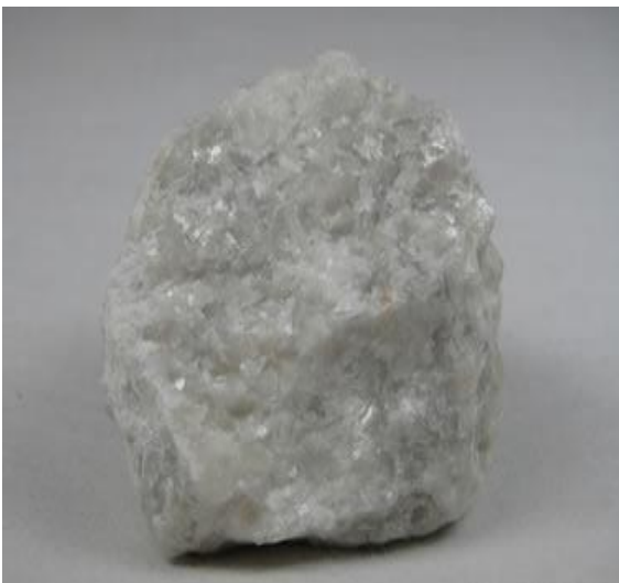
Plate x: Marble is a non-foliated metamorphic produced by metamorphism of limestone composed of calcium carbonate.