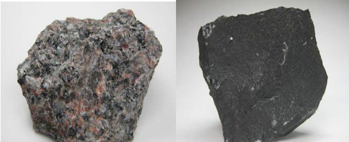
Plate i: Granite is a coarse-grained, light-colored Intrusive igneous rock Plate ii: Basalt is a fine-grained, dark-colored Extrusive igneous rock