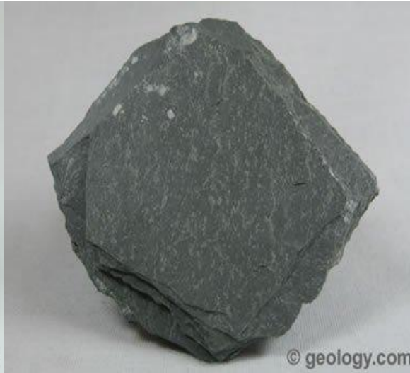
Plate ix: Slate is a foliated metamorphic rock produce through metamorphism of shale