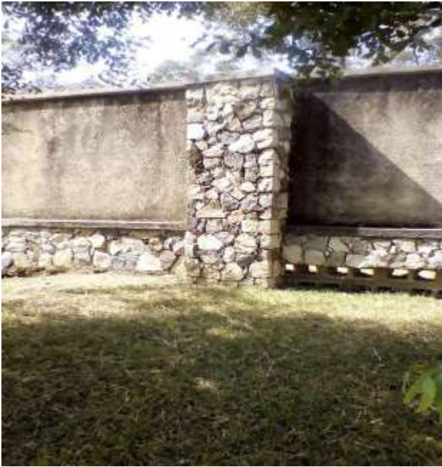
Plate xv: A mortared stone wall made from Limestone used for fencing at G.R.A. Jos.