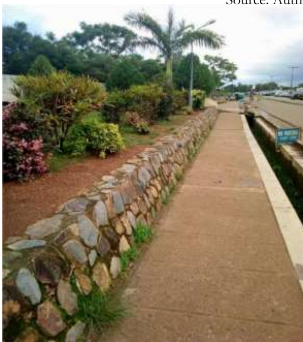
Plate xx: Sidewalk ways as hardscape element