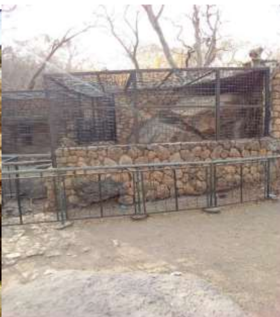
Plate xix: Construction and fencing of animal cages (Hyena house)at the Jos Zoo