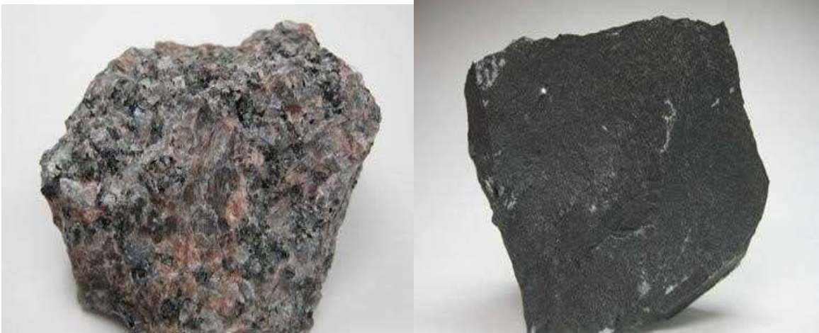
Plate i: Granite is a coarse-grained, light-colored Intrusive igneous rock Plate ii: Basalt is a fine-grained, dark-colored Extrusive igneous rock

i. Igneous Rocks: The igneous rock is a fiery rock formed due to the cooling and solidification of molten materials within the earth that is caused by either an increase in temperature, decrease in pressure or change in rock formation that gives rise to the melting of a an existing rock (Kayode, 2012). Solidification into rock occurs either below the surface as intrusive rocks or on the surface as extrusive rocks . Stones such as diorite , gabbro , granite , pegmatite , and peridotite , andesite , basalt , dacite , obsidian , pumice , rhyolite , scoria , rhyolite and tuff (See Plate i, ii, iii & iv) are identified as igneous rocks (Balsubramanian, 2017).