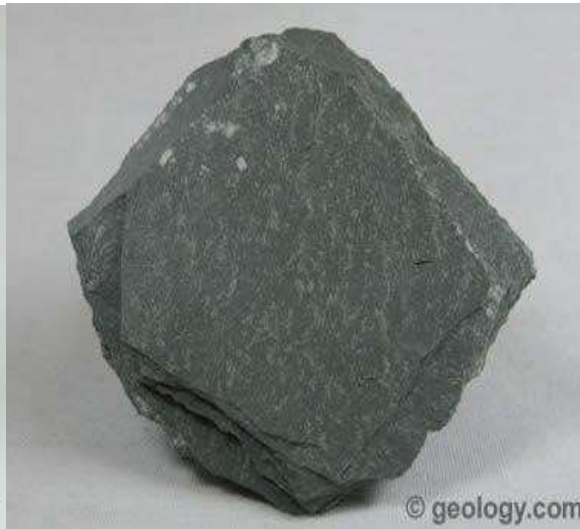
Plate ix: Slate is a foliated metamorphic rock