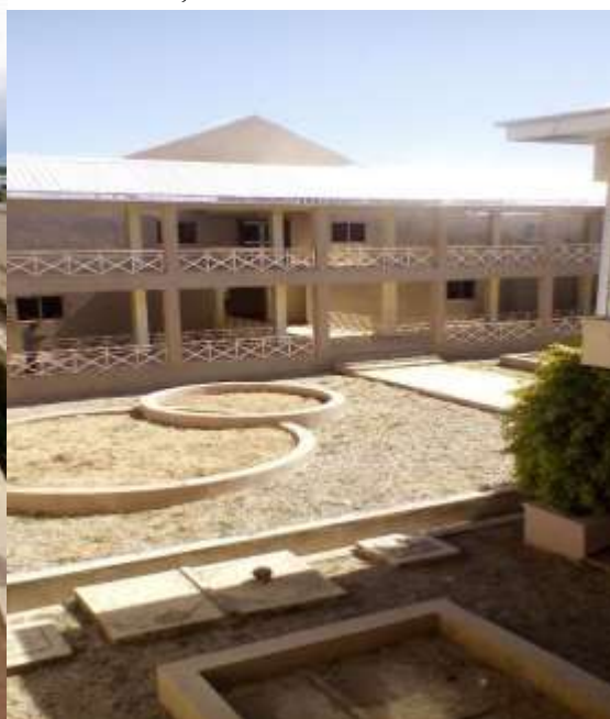
Plate xxi: Gravel used as mulch and natural ground