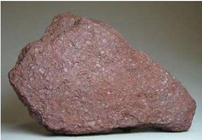
Plate vii: Iron Ore is a chemical sedimentary rock that forms when iron and oxygen (and sometimes other substances) combine in solution and deposit as a sediment.