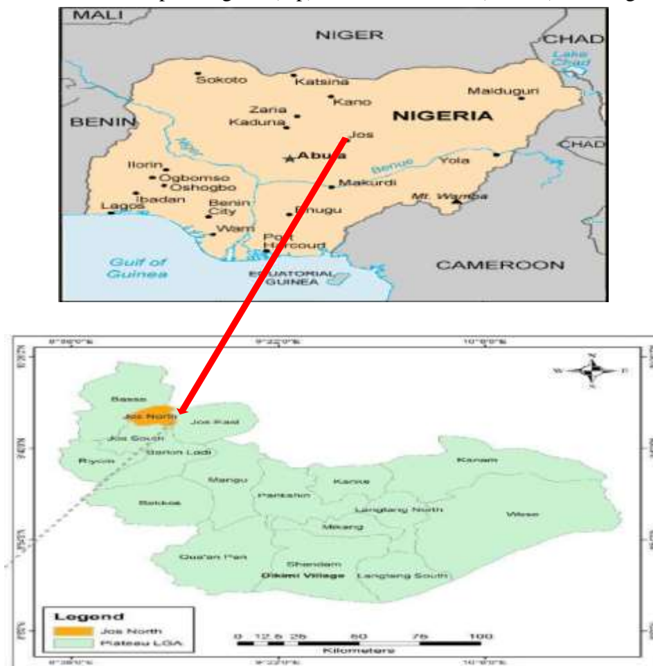
Figure 2: Map of Nigeria (top) showing Ios and Map of Plateau State (down) showing Study area.

days in October). Relative humidity is characterized by a marked seasonal variation (Aliyu, et al., 2019). Figure 2 below shows map of Nigeria (top) and Plateau State (bottom) showing the study area.