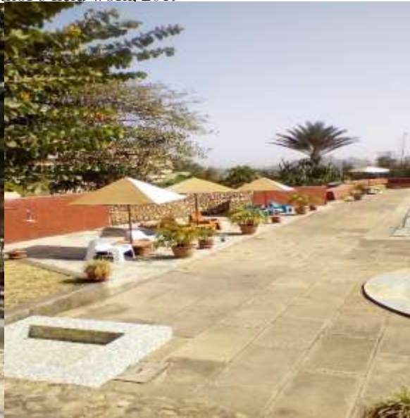
Plate xiv: Cut flagstone made from limestone used for pool decks, patios, wall caps and garden walkways at Hill Station Hotel, Jos.