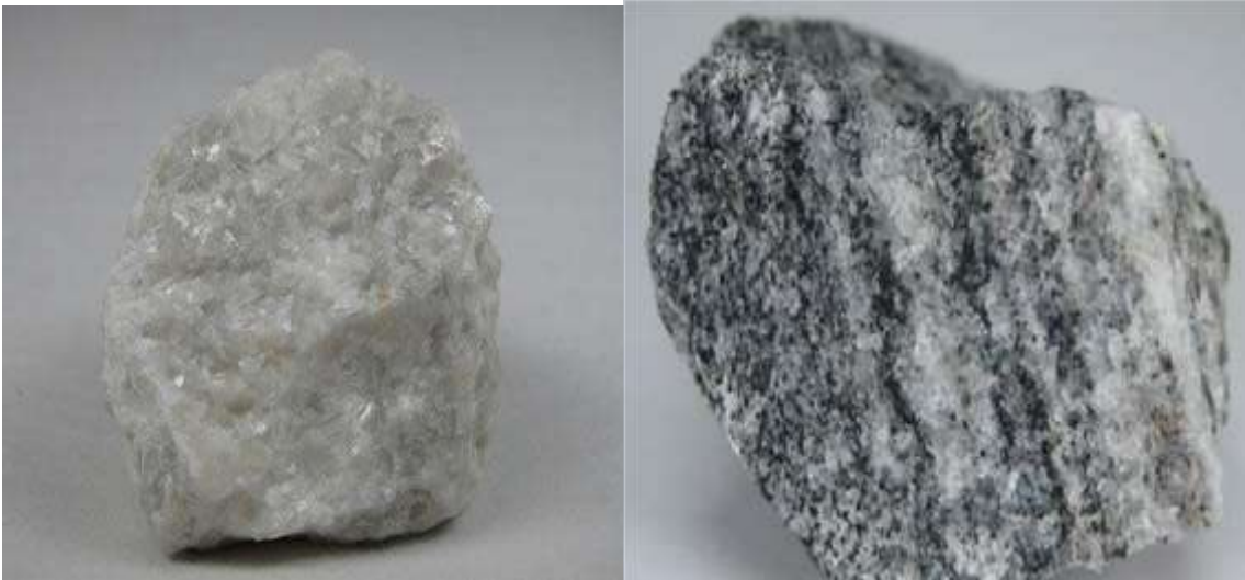
Plate x: Marble is a non-foliated metamorphic produced by metamorphism of limestone composed of calcium carbonate.