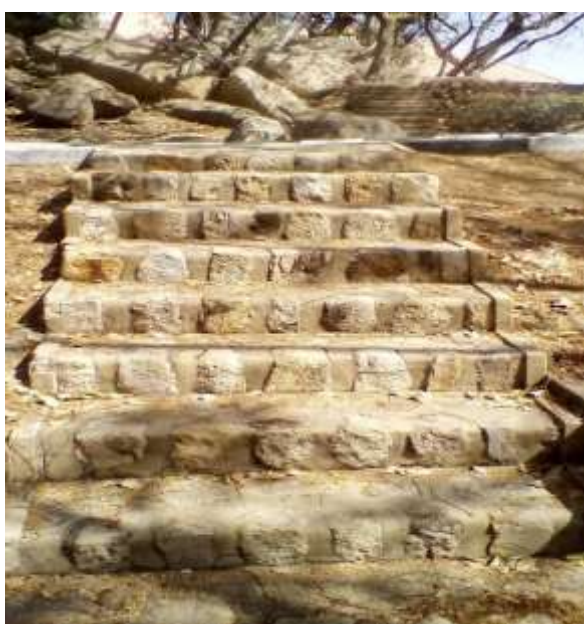
Plate xviii: Natural cut stones uses as steps at Hill Station Hotel, Jos