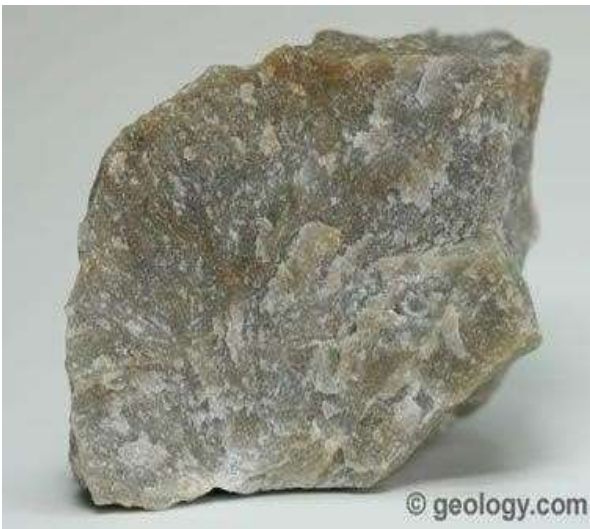
Plate viii: Quartzite is a non-foliated metamorphic

iii. Metamorphic Rock: Metamorphic rocks have been modified by heat, pressure, and chemical processes, usually while buried deep below Earth's surface. Exposure to these extreme conditions has altered the mineralogy, texture, and chemical composition of the rocks (Balsubramanian, 2017). There are two basic types of metamorphic rocks. Foliated metamorphic rocks such as gneiss, phyllite, schist, and slate (See Plate ix & xi) have a layered or banded appearance that is produced by exposure to heat and directed pressure and Non-foliated metamorphic rocks such as hornfels, marble, quartzite, (See Plate viii & x) and novaculite do not have a layered or banded appearance (Balsubramanian, 2017).