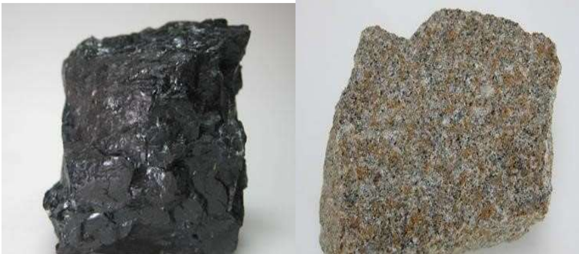
Plate v: Coal an organic sedimentary rock Formed from plant debris

There are three basic types of sedimentary rocks which namely Clastic sedimentary rocks such as breccia, conglomerate, sandstone (See Plate vi), siltstone, and shale are formed from mechanical weathering debris; Chemical sedimentary rocks , such as rock salt, iron ore (See Plate vii), chert, flint, some dolomites , and some limestone , form when dissolved materials precipitate from solution and Organic sedimentary rocks such as coal (See Plate v), some dolomites, and some limestone, form from the accumulation of plant or animal debris (Balsubramanian,2017).