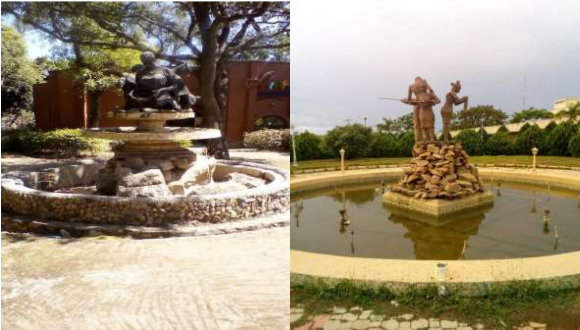
Plate xvii: Cobbles used as the base of water fountain which serves as focal points at the art gallery of Jos Zoo and the Jos University Teaching Hospital (JUTH) permanent site.