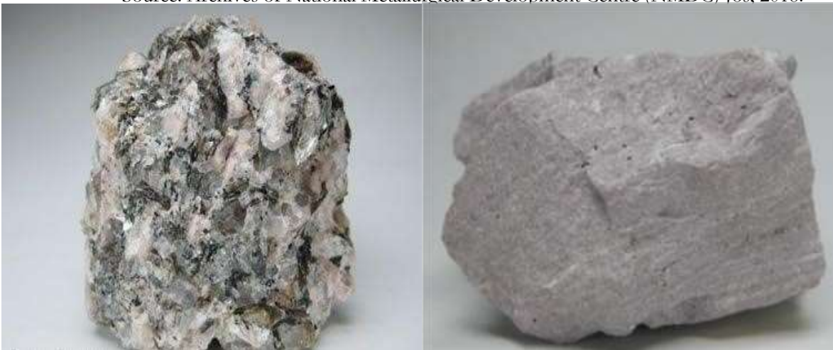
Plate iii: Pegmatite is a light-colored, extremely Coarse-grained intrusive igneous rock. Plate iv: Rhyolite is a light-colored, fine-grained Extrusive igneous rock.