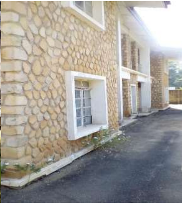
Plate xvi: Stone with good appearance used as face works on buildings at Hill Station Hotel, Jos