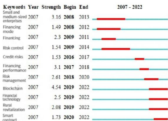
Figure 4 Abrupt evolution map of keywords in the research field of supply chain finance in CNKI database during 2007-2022

Combined with Figure 4, it can be seen that from 2019, new keywords such as "blockchain", "fintech", "rural revitalization" and "smart contract" have appeared. Since 2021, a number of provinces across the country have issued the 14th Five-Year Plan, which mentions the supporting role of supply chain finance for agricultural development and rural revitalization. For example, Heilongjiang, Henan, Shandong and other major agricultural provinces have issued relevant documents to strengthen the development of agricultural supply chain finance. Supply chain finance cuts into the core enterprises of the industrial chain and penetrates into the upstream and downstream small and medium-sized enterprises of the industry, greatly expanding the scope of financial services and expanding the coverage of agricultural inclusive finance. It should be noted that among the above keywords, the emergence intensity of "blockchain" is as high as 4.54, reflecting the growing momentum of the integration and development of supply chain finance and technology in the new era. The blockchain, which is listed as one of the